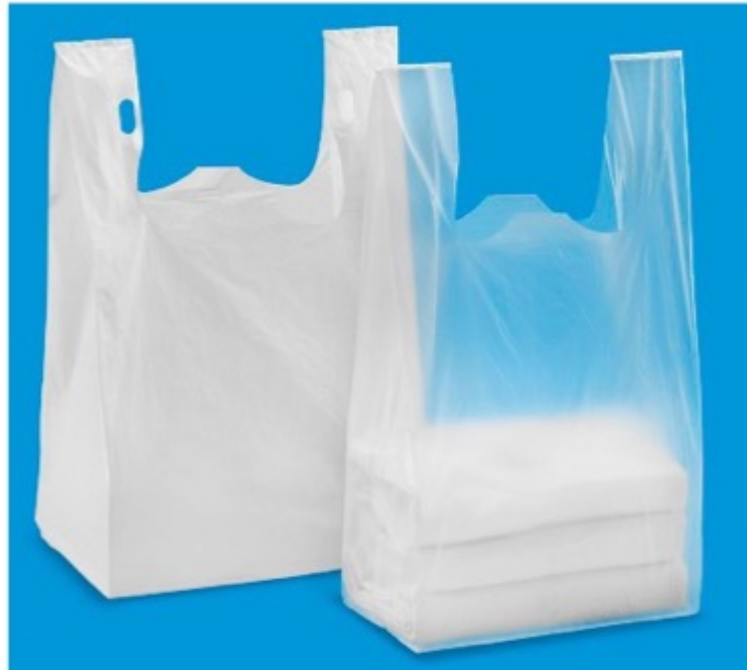
Natur-Bag - 18.5" x 21" Compostable Shopper 19 cents each