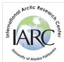
iarc.uaf.edu IARC logo sample. Download: 2999 × 2921 - 1409k - jpg