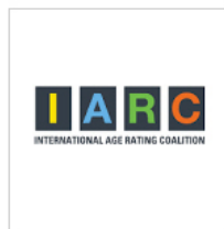
jbreslowdesign.com IARC Logo - J. Breslow Design 900 × 900 - 38k - jpg